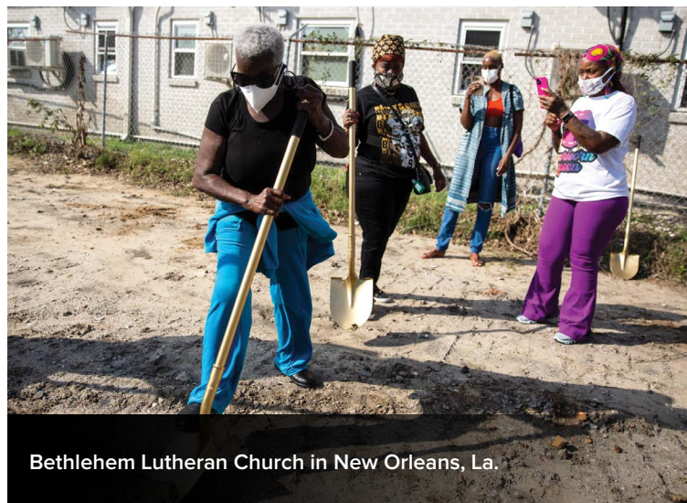
Bethlehem Lutheran Church in New Orleans, La.

In October 2021, African Descent Ministries (ADM) transitioned into new leadership. This year nine African-descent leaders completed their grief coach training. Fifty-three African-descent candidates for ministry have been confirmed as viable. Currently there are 40 African-descent/African-national missions listed across the ELCA. On Jan. 18, ADM launched the Sankofa Wellness Series, a six-session virtual therapeutic space for leaders in the African-descent community. Feb. 1 marked the launch of “Talks at the Desk,” a multimedia storytelling project for Black History Month. ADM is preparing for the “Becoming” conference in August, hosted by the Service and Justice home area. One African-descent congregation, Bethlehem Lutheran Church in New Orleans, is working on a grassroots affordable-housing capital campaign to complete four units and remodel its sanctuary over the next five years. The African Descent Strategy Team plans to reconvene in March.