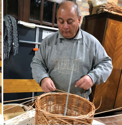
A participant in the basket-weaving workshop with his first project nearly complete.

address limited economic opportunity and skill training. In rural settings, women and Roma individuals are disproportionately impacted by lack of economic opportunity. This project focuses specifically on communities in five neighboring villages near Lake Balaton in western Hungary.