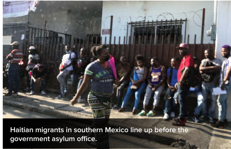
Haitian migrants in southern Mexico line up before the government asylum office.

AMMPARO 3.0 expands (1) the implementation of the Sanctuary Memorial adopted at the 2019 Churchwide Assembly and (2) the continentalization of AMMPARO that began in 2020. The ELCA has responded to the increased scope and complexity of migrant flows in Latin America and the Caribbean region. As successive political and economic crises have impacted Nicaragua, Venezuela and Haiti, displacing millions, AMMPARO has supported the emerging migrant ministries of ELCA companions and ecumenical partners in Costa Rica, Colombia, Peru, Chile and Argentina.