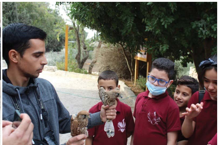
Local schoolchildren learn about bird migration at the ELCJHL's Environmental Education Center.