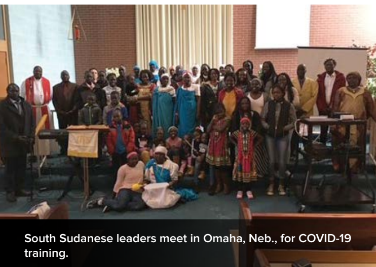
South Sudanese leaders meet in Omaha, Neb., for COVID-19 training.