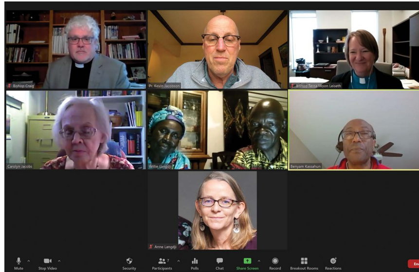
A companion synod in a virtual meeting with Bishop and Vice President of the Evangelical Lutheran Church in the Central African Republic.