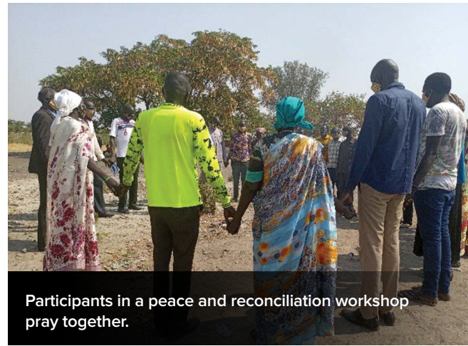
Participants in a peace and reconciliation workshop pray together.

Throughout South Sudan, violence breeds more violence, and ECSS-UNIP is striving to break that cycle. The church brings together tribal communities, ethnic groups, political parties and ecumenical partners and encourages peace-building dialogue between the groups. As part of the peace and reconciliation project, local peace committees distribute peace and reconciliation messages through social media, brochures and radio broadcasts. The messages are translated into four languages to accommodate the different ethnicities in the area. Additionally, ECSS-UNIP hosts trainings for leaders on peace-building, conflict resolution and trauma healing.