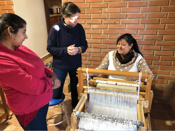
A participant in the Backyard Garden and Little Workshops project tries her hand at loom weaving during an introductory training session.