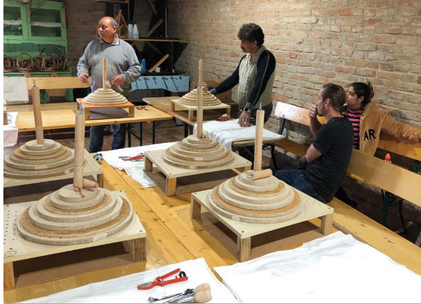
Participants in the training sessions and their families get an introduction to pottery.