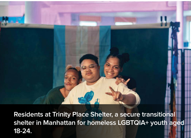
Residents at Trinity Place Shelter, a secure transitional shelter in Manhattan for homeless LGBTQIA+ youth aged 18-24.