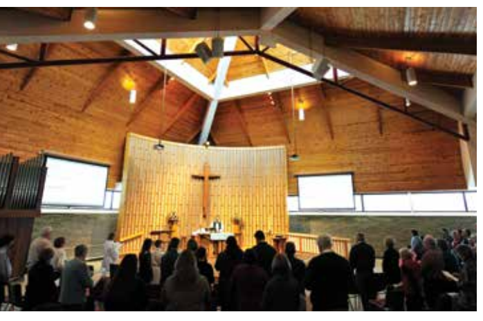
Worshipers gather in the renovated, updated sanctuary of Celebration Lutheran Church, a consolidated congregation in Westland, Mich.

Divine Savior Parish in Westland, Mich., proved to be an optimal site for Celebration Lutheran Church (celebrationlc.com), and congregation members voted overwhelmingly to purchase the church building. The site is at the juncture of four suburbs – three of which did not have an ELCA congregation. The Catholic parishioners, meanwhile, were ecstatic that another