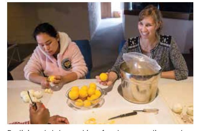
Participants take part in a food preservation and English skills workshop hosted by Iskashitaa Refugee Network, a Tucson organization that has been supported in part by an ELCA World Hunger Domestic Hunger Grant.

7 p.m., CDT. If you are interested in attending, please send an email to Hunger@ELCA.org .