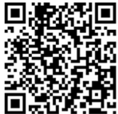
This sample QR code goes to an ELCA donation page.