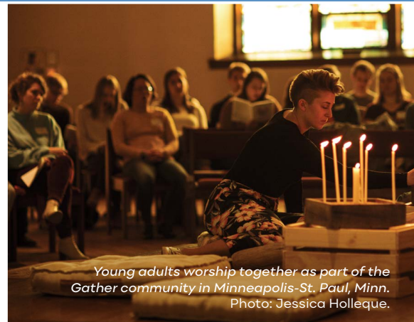
Young adults worship together as part of the Gather community in Minneapolis-St. Paul, Minn.

Engaging the next generation of leaders is central to our mission, especially through the ministries of our young-adult communities. Through programs such as Young Adults in Global Mission (YAGM), campus ministries and the International Leaders Program, young