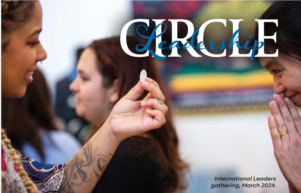
International Leaders gathering, March 2024.