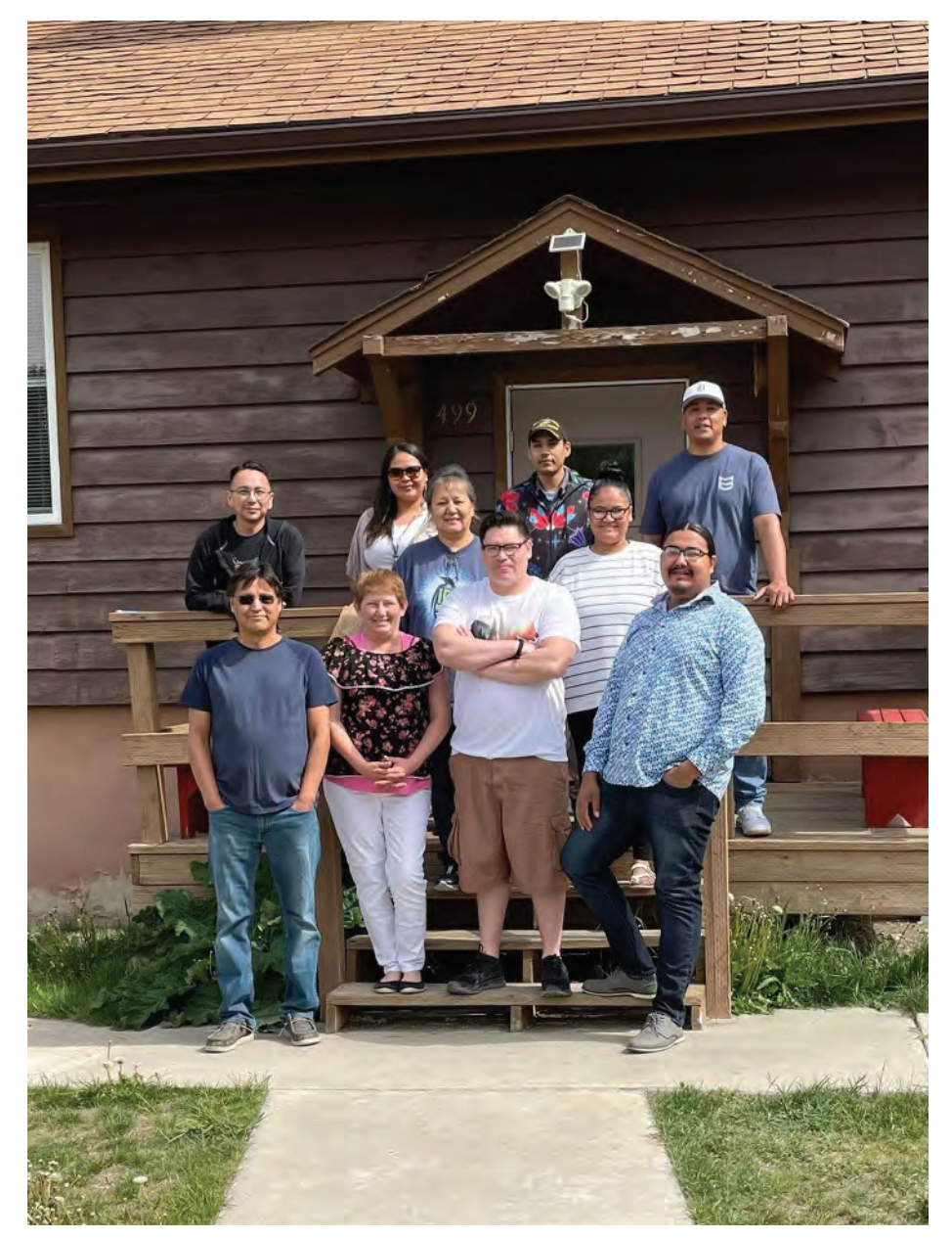
Students in a Cree language course at Our Saviour's.

The severe winter of 2022-2023 added another layer of challenge to the work of Our Saviour's Lutheran Church, a native ministry on the Rocky Boy's Reservation in Montana. Like all ELCA-affiliated Indigenous ministries, Our Saviour's is a leader in developing community, climate and cultural resilience - key elements of culturally informed capacitybuilding and hazard mitigation work. The congregation's work in the community includes lending its space for traditional ceremonies, revitalizing the Cree language and providing care packages for community members undergoing in-patient treatment for substance abuse disorder. These activities require a safe indoor gathering space in the increasingly harsh winters of the Montana plains. Lutheran Disaster Response, in partnership with ELCA Indigenous Ministries and Tribal Relations, ensured that Our Saviour's cultural resiliency work could continue over the winter.