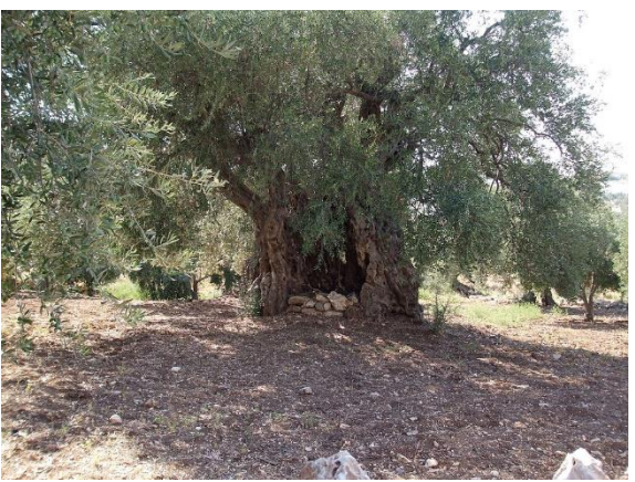
Olive Tree in the al Maiser region of Hashimiyya, Ajloun, Jordan.

tree, producing 5-10kg. of oil, we arrive at 10-15 trees, or one "dunam" of trees, per household...a typical Israelite village, 6.2 dunams in area on the average, would need 31 dunams planted in olive trees for its own use [this equals 310-465 trees]."<sup>49</sup>