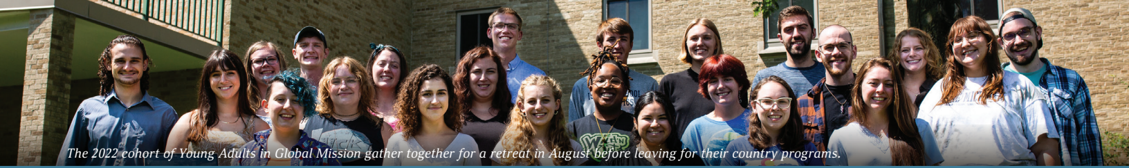
The 2022 cohort of Young Adults in Global Mission gather together for a retreat in August before leaving for their country programs.