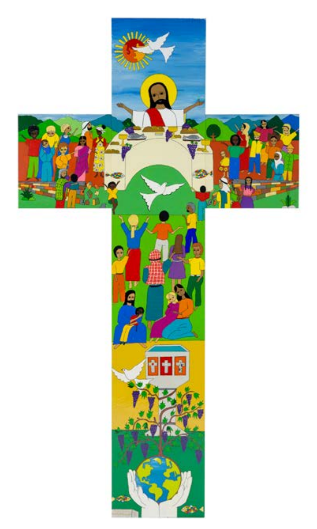
The Salvadoran cross, commissioned by artist Christian Chavarria Ayala for the Joint Commemoration of the Reformation, was carried in the procession at the beginning of the service. The cross depicts the triune God's creative, reconciling, and sanctifying work. Image: LWF/Christian Chavarria. Used by permission. All rights reserved. Permission is granted for congregations to reproduce this page provided copies are for local use only and the following copyright notice appears: From Declaration on the Way Study Guide , copyright © 2017 Evangelical Lutheran Church in America.