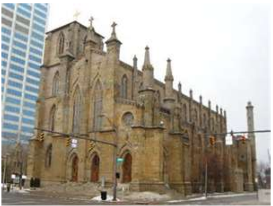
St. Joseph's Roman Catholic Cathedral

St. Joseph's, the cathedral church of the Roman Catholic Diocese of Columbus, is a gothic landmark that dates back to the 1860s. Located at the intersection of East Broad Street and 5<sup>th</sup> Street, it is the site of the Opening Prayer Service for the 2013 National Workshop for Christian Unity. The cathedral will also host the Tuesday evening Eucharist.