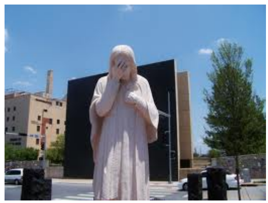
"Jesus Wept" sculture on grounds of St. Joseph's Old Cathedral, across from Oklahoma City National Memorial