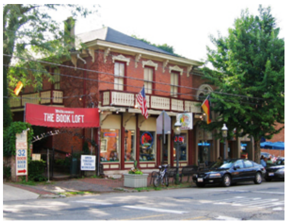
German Village in Columbus

The Sheraton Hotel does offer a complimentary shuttle service in the downtown area only (<u>not</u> to the airport), including service to the Short North and German Village areas – which are local shopping and entertainment venues. The shuttle operates Monday through Friday during select times. For more information, please contact the hotel concierge.