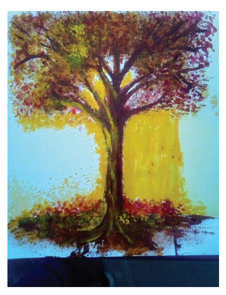
Art by Jibril Bey, The Welcome Church

"[Jesus] told them a parable: 'Look at the fig tree and all the trees; as soon as they sprout leaves you can see for yourselves and know that summer is already near'" (Luke 21:29-30).