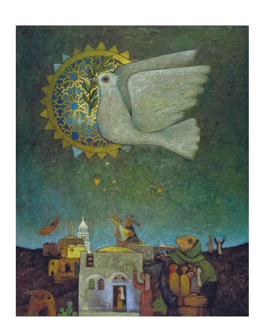
Our cover depicts the painting "HOPE" by Palestinian artist Sliman Mansour. The white building it portrays is the Lutheran Church of the Redeemer in Jerusalem.