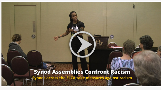
Synod Assemblies Confront Racism Synods across the ELCA take measures against racism