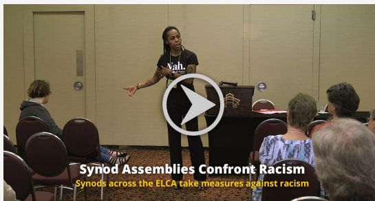
Synod Assemblies Confront Racism Synods across the ELCA take measures against racism